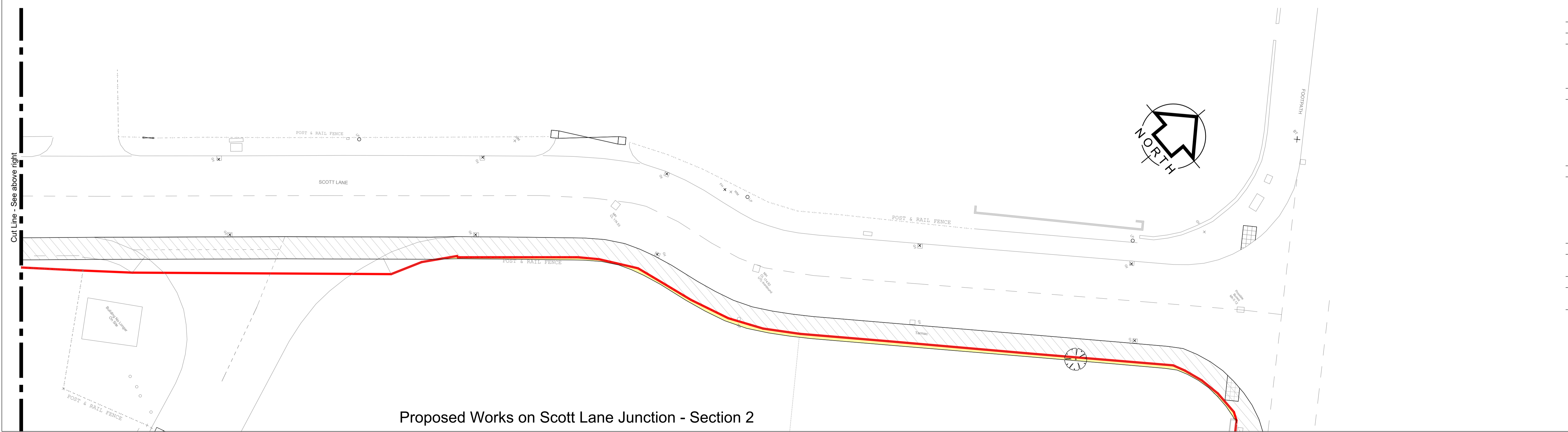
Proposed Works on Scott Lane Junction - Section 2

Health and Safety Notes/CDM Regulations 2015 In line with the above regulations we are obliged to inform the Contractor of the abnormal risks that may be encountered in the construction of these works. As part of the design process all the salient health & safety aspects are given full consideration and these are observed within the designs viewed on this document. Although considerable effort is undertaken to eliminate risks, the very nature of the project gives rise to some hazards and risks. Significant risks that cannot be eliminated by design and could not be foreseen by a competent contractor are noted in the risk assessment boxes on the drawings.