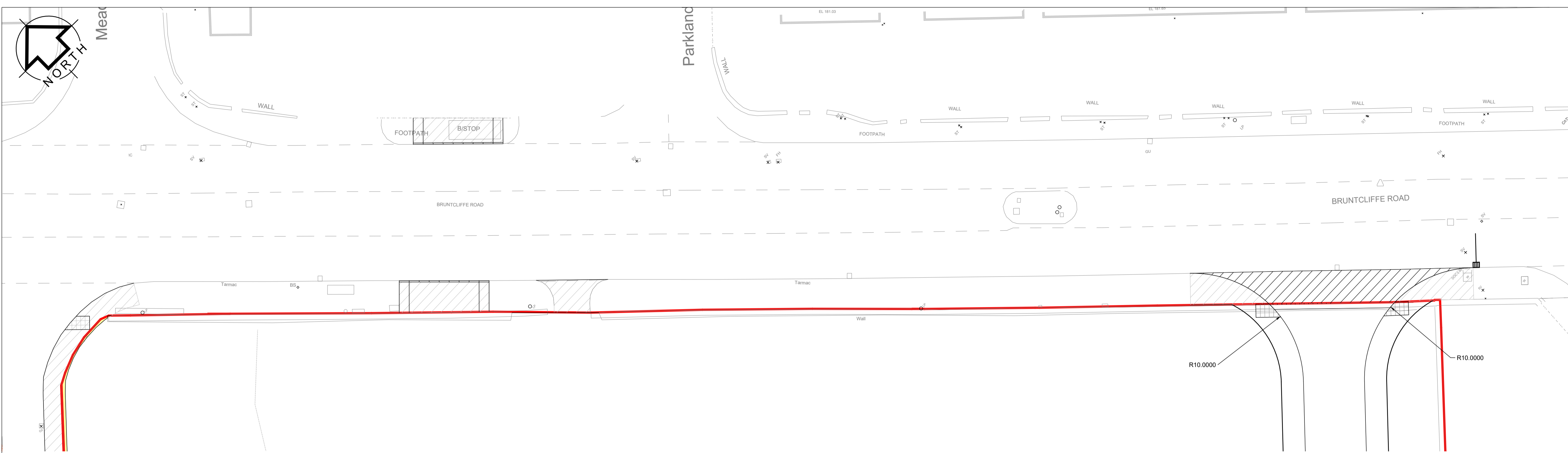
Proposed Works on Bruntcliffe Road Junction